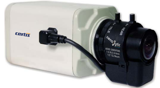
CCD480-AD C/CS MOUNT CAMERA (LENS:OPTIONAL)